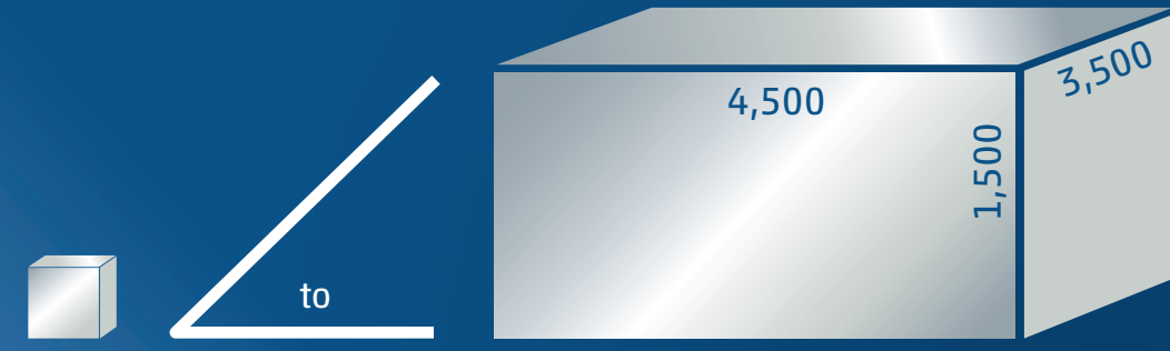
Small parts W 10 x D 10 x H 10 mm